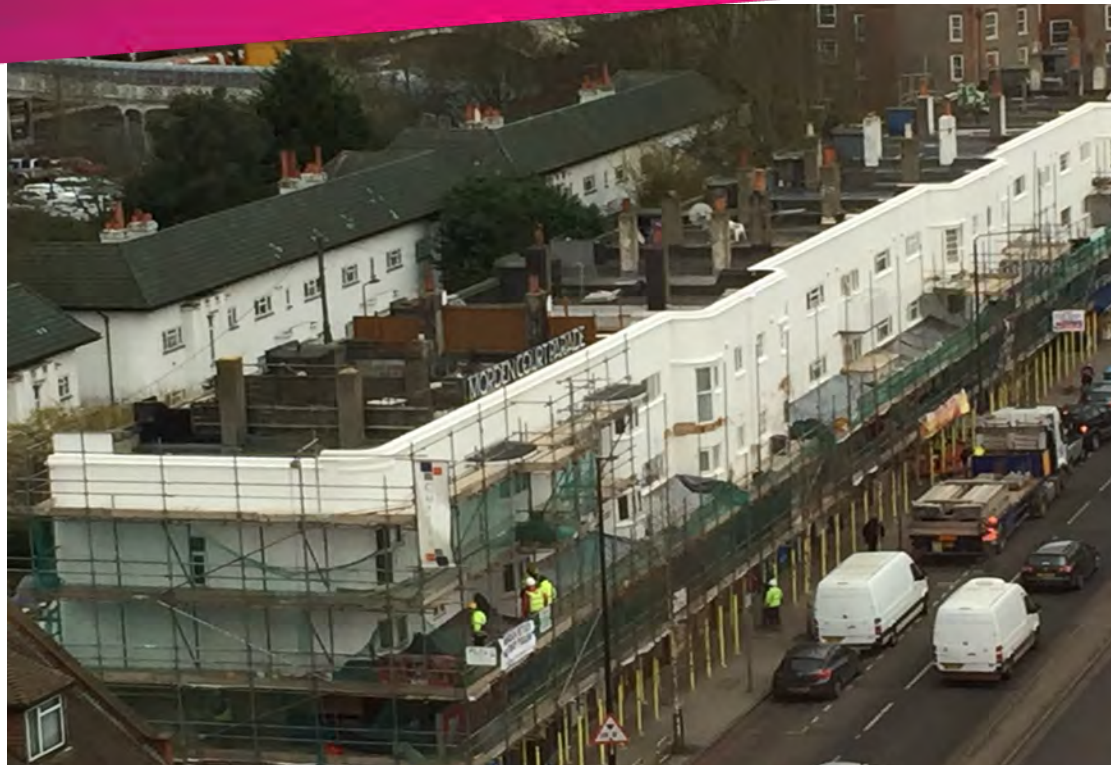
New signage in London Road